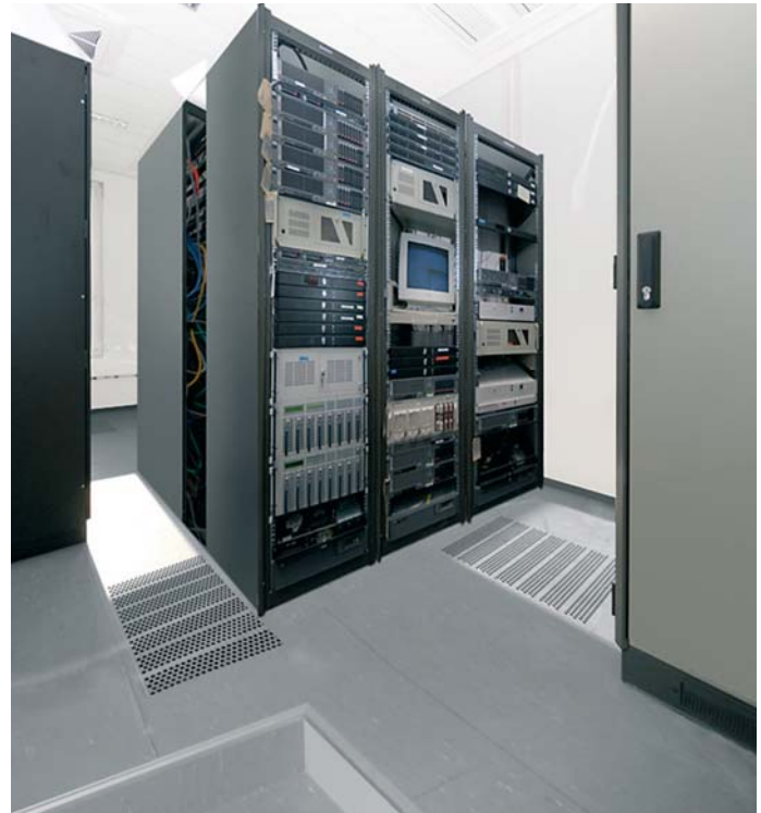
Moving into the new EMPIC computer operation centre: The air condition works in a failover configuration and with double floor layout.

any user interaction. This guarantees that the data is up-to-date at any time and place. The solution fits ideally into the complete architecture of EAP and fulfils the demands to security, memory use, performance and server clustering. The customer can switch this function on and off, even individually per end user. EMPIC is currently implementing further applications based on this service; i.e. a broadcasting message service to all users. CM and MPL will be the first modules to run with DPS.